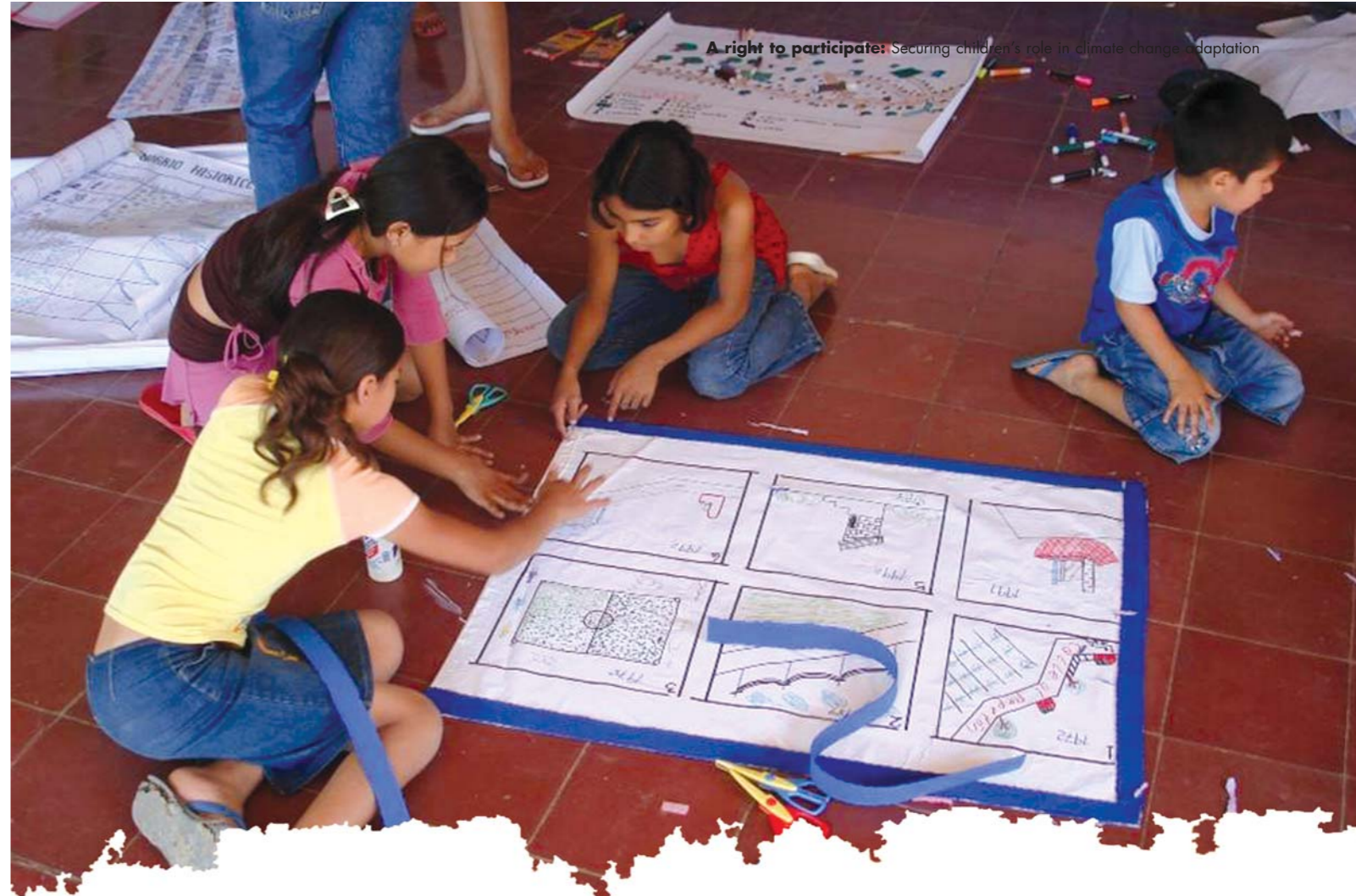
A right to participate: Securing children's role in climate change adaptation

The children were very pleased that they had influenced this important decision and said they had no regrets about the decision to move. The new school was opened in July 2007 in Pasanon, a safer location a few hundred meters from the temporary school, with co-financing from Plan. The school is safe from landslide and flood and also includes earthquake mitigation measures such as steel ties on the roof.